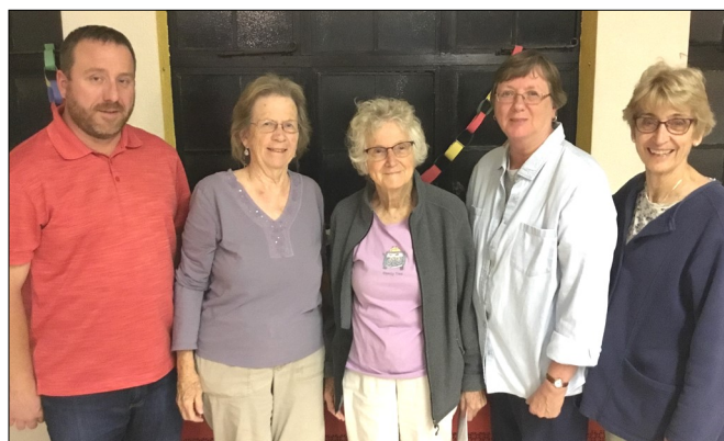
Our UUCLV Property Committee 2017-18

As we are now into the 2018 year, your property committee is focused on projects such as getting the Center Street stained glass window repaired, replacing the Wall Street door, repairing some broken cement sidewalks areas, replacing some ceiling light fixtures, painting the FM kitchen walls that were water damaged, and wrapping those pipes with decorative rope. As the year progress there will be many more repairs and just general upkeep of our beloved church building.